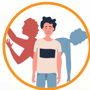
Abnormal motor behavior